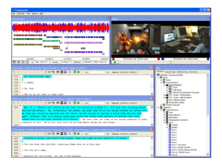
Figure 3: Complex data in Transana 2.41 (enlarge this figure here) [25]

Since the release of version 2.40, Transana has had the capacity to handle multiple simultaneous media files. Both media streams were loaded into Transana 2.41 so that they could be synchronized and displayed simultaneously, side by side. This can be seen in the upper right section of Figure 3.