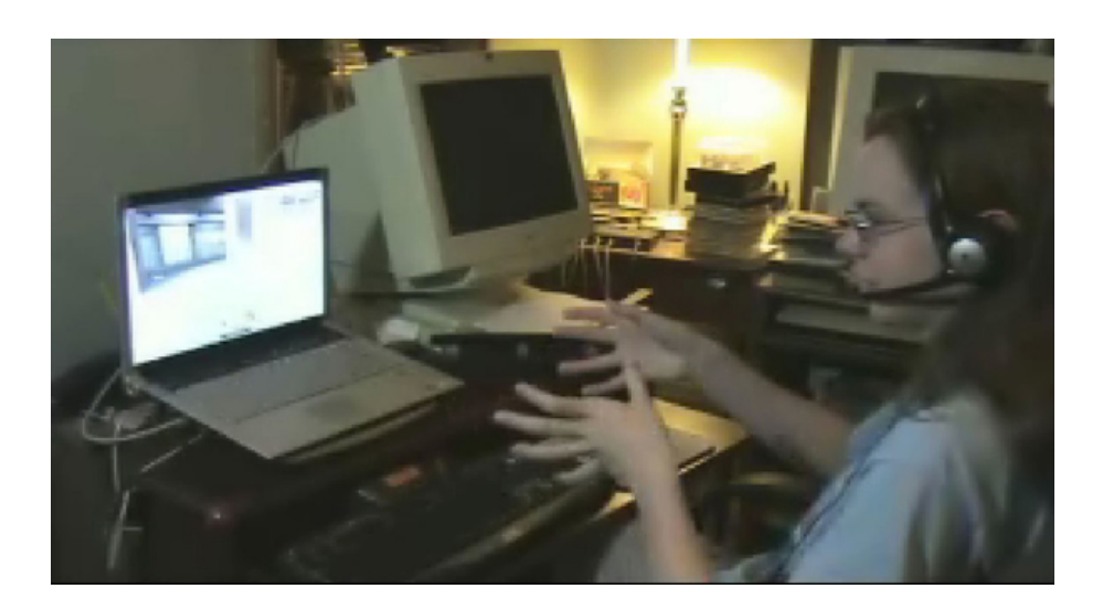
Figure 1: Video capture of the subject playing the game [18]

The audio track for this video consisted of all sounds made by the observed player, both in-game chat directed (through his headset microphone) at other game players and talk-aloud commentary directed at the researcher. The subject and the researcher interacted during some of the game play, with the researcher asking occasional questions about the game context and the play decisions the player was making. No audio from the game itself or chat from other game players within the game's chat channel was captured by the camera, as the observed player was wearing headphones rather than having game sound come through his computer speakers. [19]