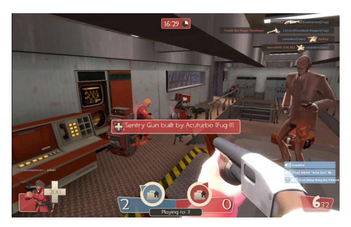
Figure 2: Video screen capture of game play [20]

Thus, the data set being examined consisted of two simultaneously-recorded, overlapping video files, each of which captured a different set of details about the game play being studied. One video file shows the player and his computer, while the other shows just the computer display in much greater detail. The two video files have totally separate audio tracks, with one file including all sounds made by the observed player and the researcher, and the other file including all sounds produced by the game and all in-game chat contributions made by all players except the observed player. The game environment was too complex for either method to capture all the important data; it is only through examining both media streams that we get a full picture of this player's in-game experience. [21]