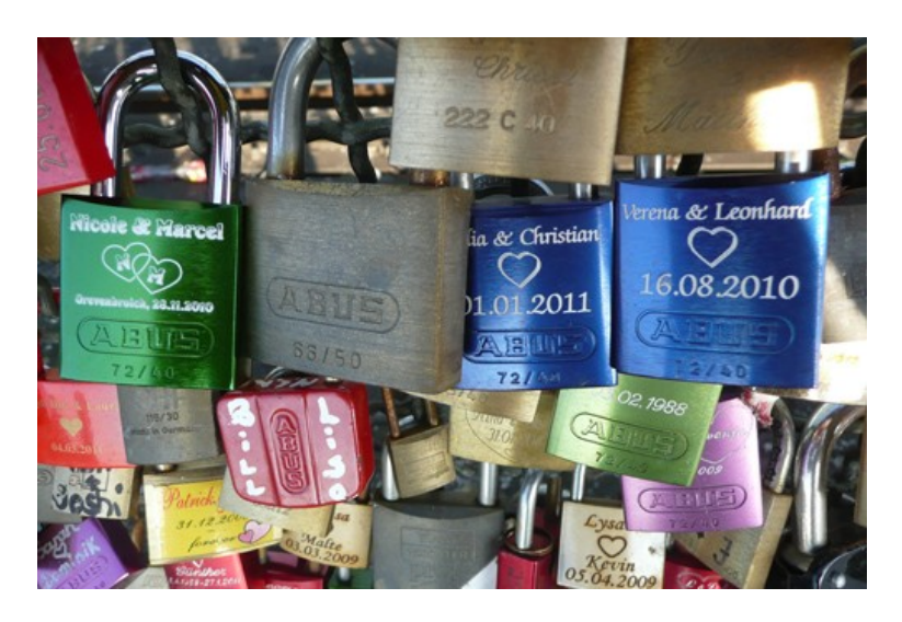
Figure 2: Self-made padlocks and professionally manufactured ones at the Hohenzollern Bridge [16]

couples abide to this limitation, which points to an established rule. Only very few couples deviate from this rule and attach a larger tin or plastic heart to their padlock, whereby they of course also occupy more space than the others. But while there are variations in shape and design, the names or initials are always the central part of the padlocks. Partly the names are applied with touch-up pens or felt pens, but by now, many locks are also furnished with a professionally applied engraving or inscription; in fact, a veritable couple-padlock industry appears to have emerged, providing ready-made products with different colors and fonts. Especially on these, but also on the self-made padlocks, we usually also find graphic symbols of attachment, like plus signs, the symbol "&,"11 or interwoven hearts and wedding bands (Fig. 2).