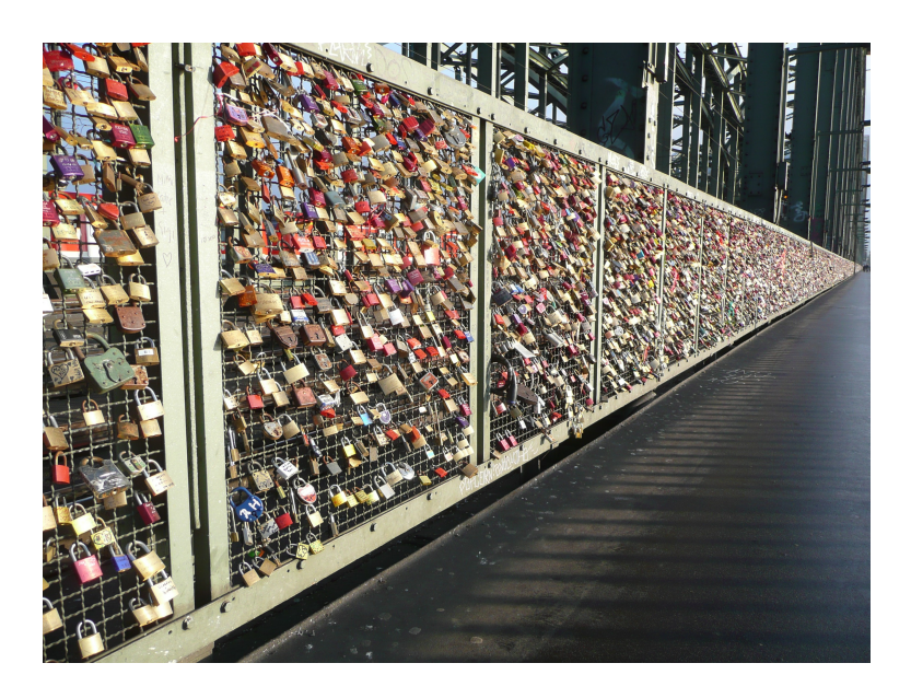
Figure 1: Padlocks at the Hohenzollern Bridge in Cologne, photographed in 2012 [1]

Rather unusual for sociological research, this article deals with an artifact. More precisely, I am going to look at a specific practice in which an artifact plays a decisive role: couples label padlocks with their names or initials and visibly install them in public places and especially at bridges. This has become a widespread custom in a relatively short period of time; today there is hardly any city without a padlocking spot anymore. In Germany it is particularly the Hohenzollern Bridge in Cologne (Fig. 1) that came to fame in the wake of this practice. Meanwhile there are so many padlocks placed here that Cologne has virtually gained yet another tourist attraction.