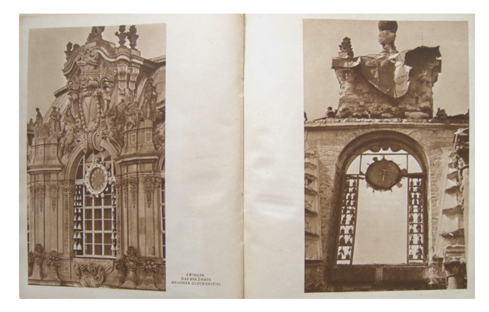
Figure 4: The Zwinger with it's glockenspiel, made of porcelain (see SCHAARSCHUCH, 1945, pp.12/13.)