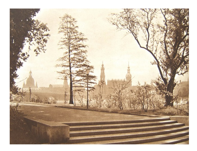
Figure 10: The silhouette of "old Dresden" in the 1930s (see SCHAARSCHUCH, 1945, p.14. For permission to reprint the photo I want to thank the Stadtmuseum Dresden.)

"This last image shall once again show us the old city, the wonderful silhouette of the city. When in 2005 the Frauenkirche will have been erected again, one might think that the firestorm never went over Dresden. Then Dresden will be beautiful again." [24]