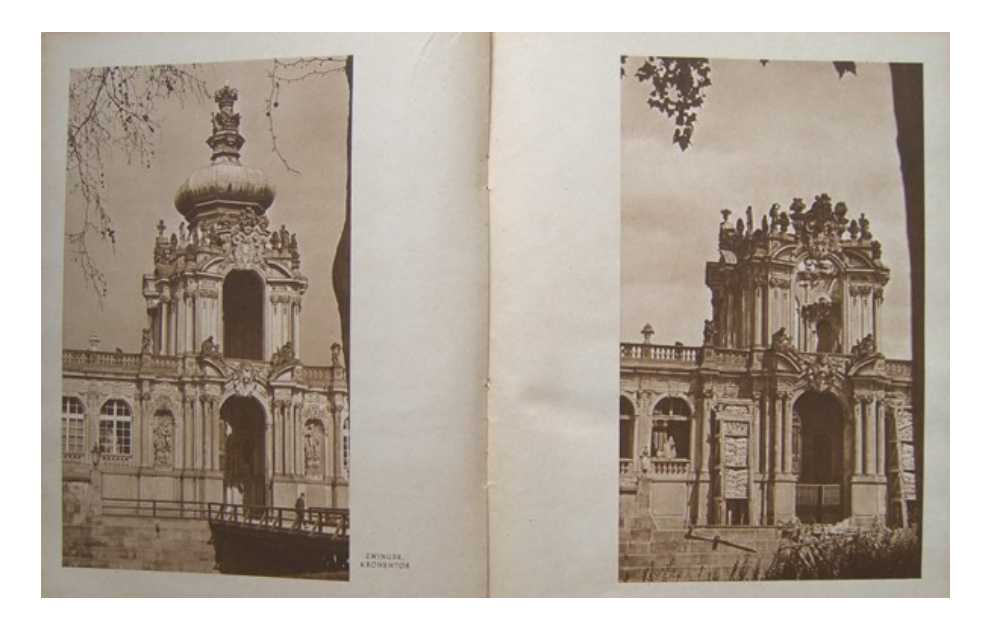
Figure 3: The Zwinger (a luxurious Baroque building) with it's Kronentor (crown portal) (see SCHAARSCHUCH, 1945, pp.8/9. For permission to reprint the photos I want to thank the Stadtmuseum Dresden.)