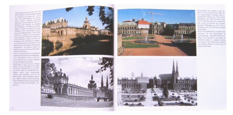
Figure 8: The Zwinger wall and the Zwinger courtyard in the 1930s and nowadays (see for example SCHIEFERDECKER & MÜNCH, 1999, pp.8 and 9. For permission to reprint the contemporary photos I want to thank the photographer, Christoph MÜNCH, and for the pre-war photos the Deutsche Fotothek/Sächsische Landes- und Universitätsbibliothek [Zwinger wall: archive number df_m_0005156; Zwinger courtyard: archive number df_0053432].)

photographs of building memorials—again from the same angle (see Figure 8). These are mirror images of splendid Dresden by the reconstructed city, the contemporary photographs impressing by their colorfulness (see Figure 9). There is the impression that old Dresden has resurrected and is more alive than ever. Nevertheless, it becomes obvious what is missing.