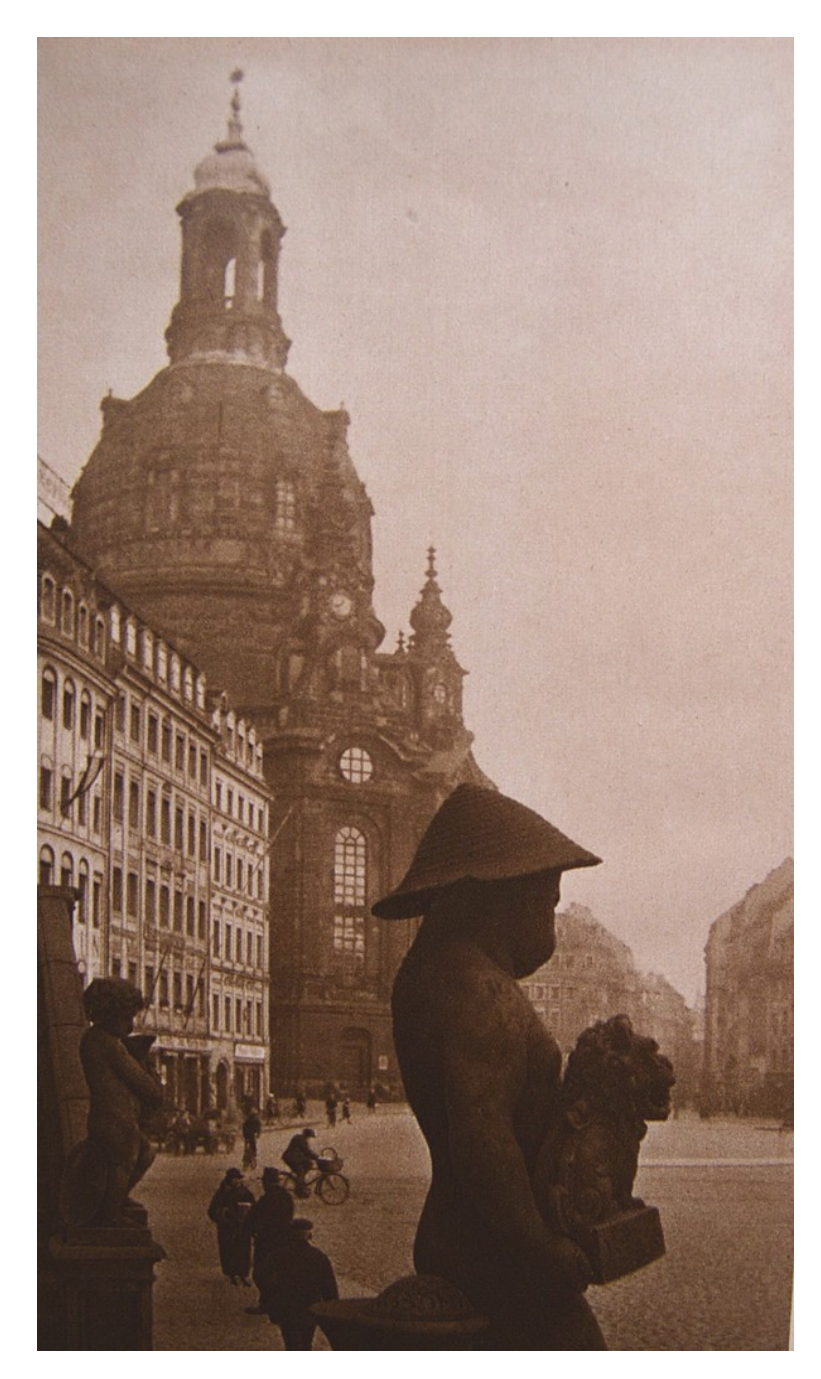
Figure 1: The Frauenkirche and the Neumarkt square in the 1930s (see SCHAARSCHUCH, 1945, p.16.) [17]

The content of the photo is a square, surrounded by houses, which in the background leads to a narrow street. In the foreground two figures, hewed in stone, are conspicuous. In the left half of the image there rises a high building with a cupola, which in the lower left half is covered by a front of houses. It is the Frauenkirche on the Neumarkt. In the square, along the front of houses, some passers-by can be seen. Apart from this there are no more people in the square.