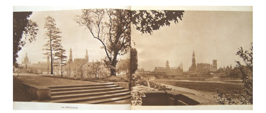
Figure 5: The silhouette of "old Dresden" (see SCHAARSCHUCH, 1945, pp.14/15. For permission to reprint the photos I want to thank the Stadtmuseum Dresden.)