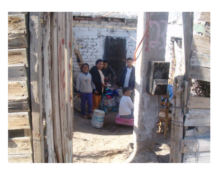
Figure 2: Family of the participant [28]

built with the effort that bind together those of our family, and that's why we do not worry, in our house we do not lack potatoes, beans, corn tortillas and a chicken leg, sometimes."