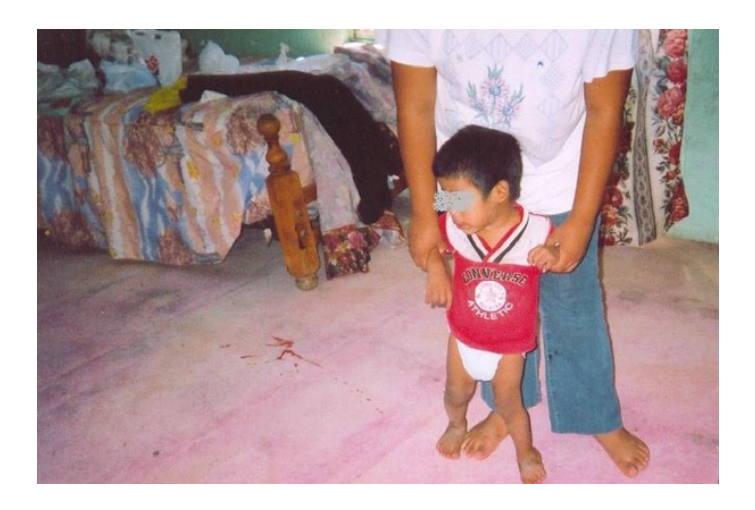
Figure 3: Three-year old boy with motion impairment [29]

A second variation of the first category is shown in the next photograph, taken by the mother of a three-year old boy who could neither walk nor talk. He is being held by his aunt, so he can stand on his feet. The mother of the child explained to me that this picture is very important to her because it shows how both doctors and the health system have failed to help her and her son. She mentioned that the doctors kept telling her that her son had no problems at all, that all his cognitive and motor functions were alright, and that it was only a matter of time until her son would be able to walk and talk. She said: "Doctors in the Seguro<sup>5</sup> do not pay attention to me."