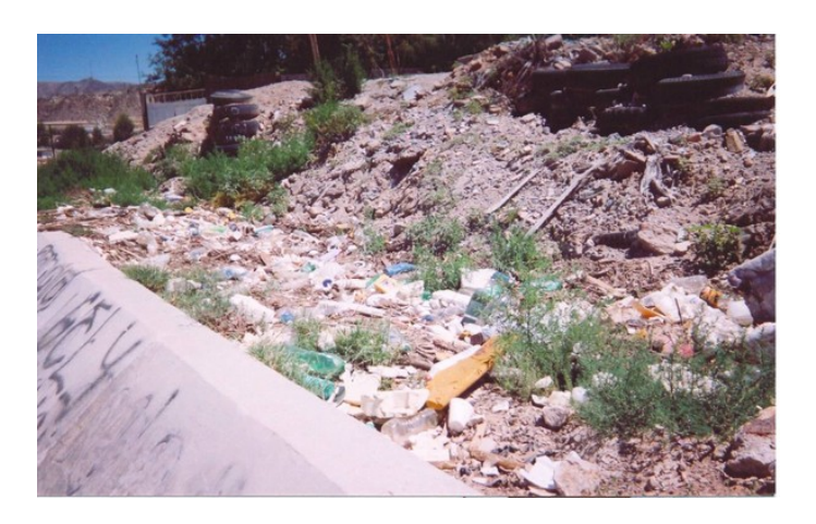
Figure 4: Garbage found close to the participants' homes [30]

The participants were also worried about contamination and the bad conditions of their physical environment, especially of locations close to their homes, schools, and places of work. Their photographs reflect the frustration they feel when they see garbage thrown in empty fields that are very close to their homes, children having no other place to play than in dirty streets, and playgrounds full of dirty water and contaminated mud. In many of the interviews related to these pictures there were comments blaming the city authorities for not doing enough to clean up their neighborhoods, especially the places where children regularly play.