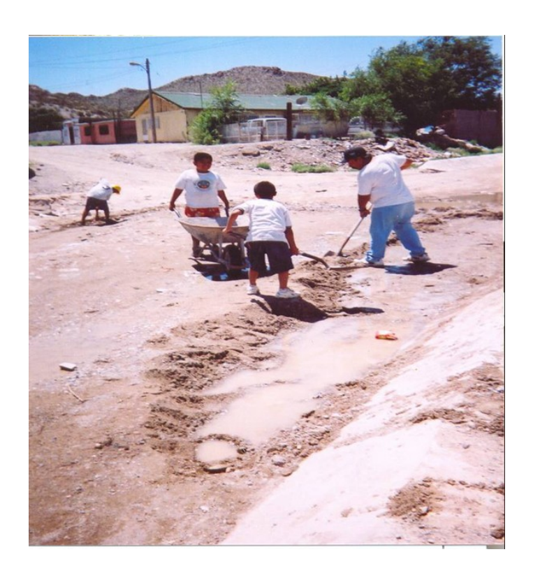
Figure 6: Actions performed by community members in order to improve the quality of the surroundings [32]