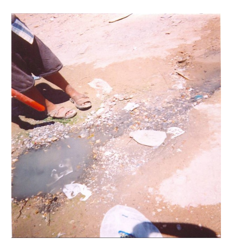
Figure 5: A puddle of dirty water [31]

The third theme that emerged from the narratives of the participants is the involvement of the community in coping with some of the most immediate and dangerous issues they face. Some of them are exemplified in photographs of people cleaning a street, fixing walls that are about to fall, and cleaning a field full of debris. Once more, there were comments generated by the photographs regarding the lack of involvement of governmental authorities in what people considered a long-forgotten responsibility: "If we don't fix it, nobody else would do it." The images that reflect the community's action represent the little hope they have for a better future for all: "At least we can take care of our streets." These photographs were produced as a reflection of how people can work together, using in the most effective way the very scarce resources they have.