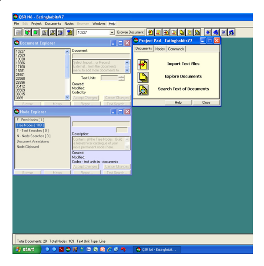
Figure 1: N6 user interface

The user interface of N6 is bespoke as illustrated in Figure 1 although it provides all the normal methods of interaction (menus, buttons on a toolbar, right click context sensitive menus and shortcut keys). In contrast, NVivo7 adopts a standard Microsoft interface (of the same style as Outlook) so much so that it was used as a reference project at Microsoft conference, TechEd, in Boston (see Figure 2).