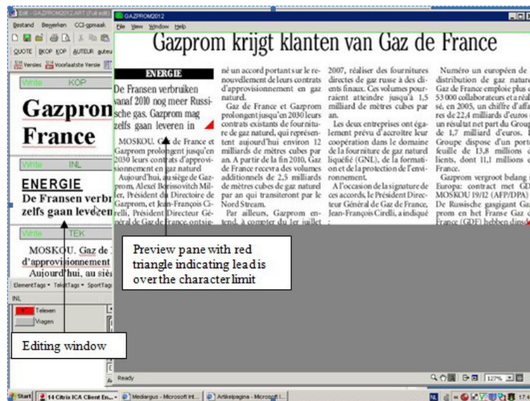
Fig. 2: Screenshot of the preview window [36]

before returning to the LR8 formulation ("This is what Gaz de France and Gazprom have agreed") in LR11. In each of these versions, Gaz de France is in first position, i.e., an equal if not more important partner, and the focus is on the economic activity of making joint business agreements. The seeds of potential threat sown in the first sentence (introduced in LR2) are thereby balanced with a sense of the normality of business transactions in which the notion of political threat is beyond the scope. LR12 sees a subtle but salient transformation as Gazprom is now placed in theme (initial) position: "Gazprom can even supply in France" (see Figure 2). Constraints of space and time, which only become visible through the mode of close micro-observation enabled by the Camtasia and Inputlog software packages thus play an intrinsic role in the representation of power relations, control and threat.