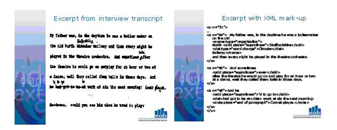
Figure 4a: Example taken from ESDS Qualidata for recording, formally an annotated qualitative interview using XML mark-up

adding metadata through manual or automated mark-up of XML documents: