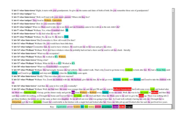
Figure 4b: Example taken from ESDS Qualidata for an automated marked up qualitative interview using a beta text mining programme, not available (enlarge this figure <a href="here">here</a>) (CORTI, 2006)

annotating metadata about the interview in a CAQDAS package, in this case an older version ATLAS.ti, see Figure 5: