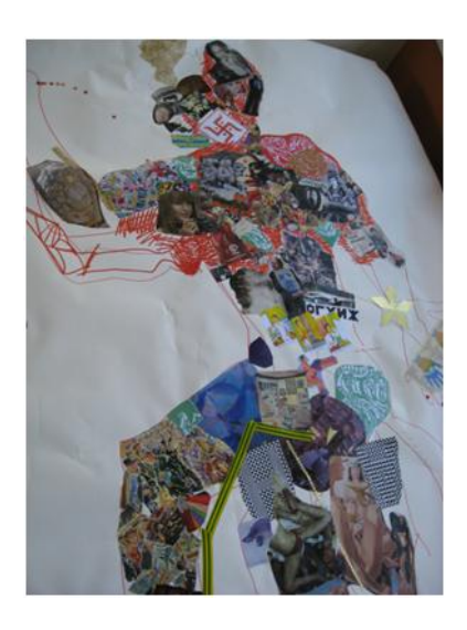
Figure 4: Ali's visual autobiography [29]

images sets in motion a narrative process of "deforming" or decomposing meaning (KRAUSS, 1993).