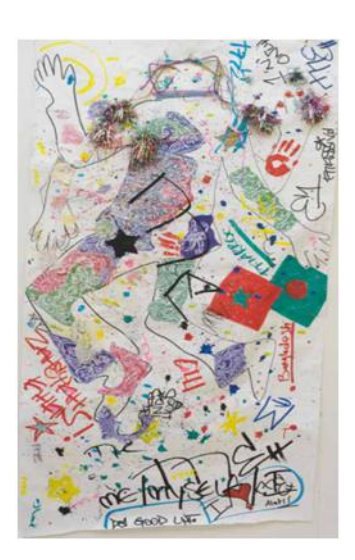
Figure 1: Bushra's visual autobiography [24]

One form of narrative succession involved spatial mapping: proceeding around the body in making the work, and often, telling about it in this order too. Both adults and children displayed this pattern. Workshops started with BURMAN drawing round the body of the person. Participants were encouraged to have more—or no—heads, arms, legs; to twist, narrow or expand their bodies and to signify action if they wanted to. BURMAN who has conducted similar workshops in many UK and international environments provided a large selection of culturally diverse materials for people to use: Acrylic paint pens; printed images from a variety of artistic and cultural traditions; glitter, mylar, sequins magazines and natural materials for collage. Participants were asked to bring their own materials to the workshops if they wanted to. They were not given any instructions on how to proceed with their images and/or what materials to use or not to use. In the workshop, Bushra (all names have been changed), for instance, who was in her early years at secondary school, worked first on particular areas—face, hair, centrally-placed flags of her parents' countries of origin, hands and feet. Afterwards, she filled up the silhouette by choosing specific materials—cut-out images, bindis, glitter, graffiti tags, paint—and then scattering them over the image, building up layers of them.