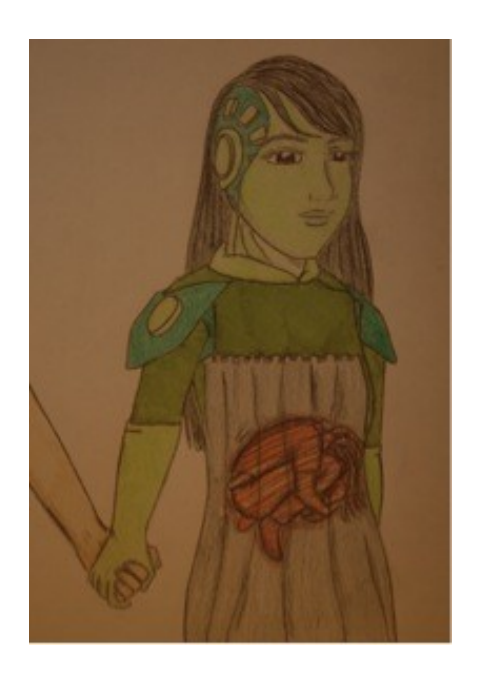
Illustration 9: "Concealment" (p.95)

In my study, the arts unexpectedly became "deeply integral to meaning making and analysis" (NGUYEN, 2015, p.153). I systematically drew as I moved through the analytic phase. Illustrations 9, 10, and 11 highlight my analytic interpretations of the women's narratives.