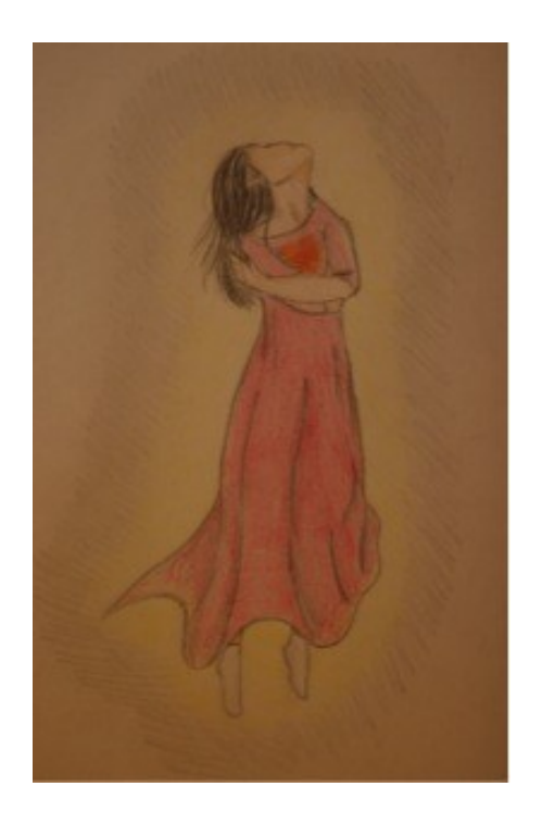
Illustration 10: "A transformative lesson" (p.114)