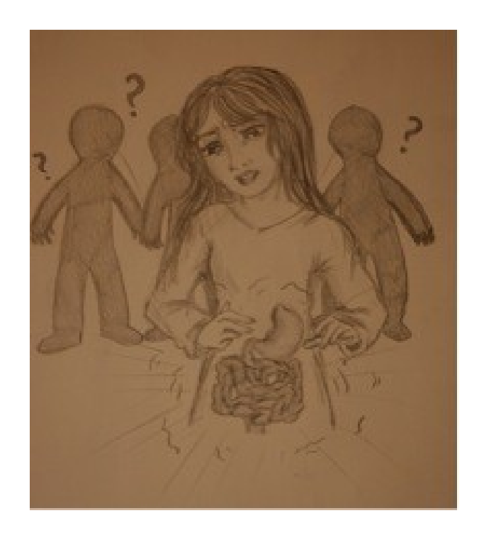
Illustration 2: "Stigmatized, disrupted" (NGUYEN, 2015, p.33)