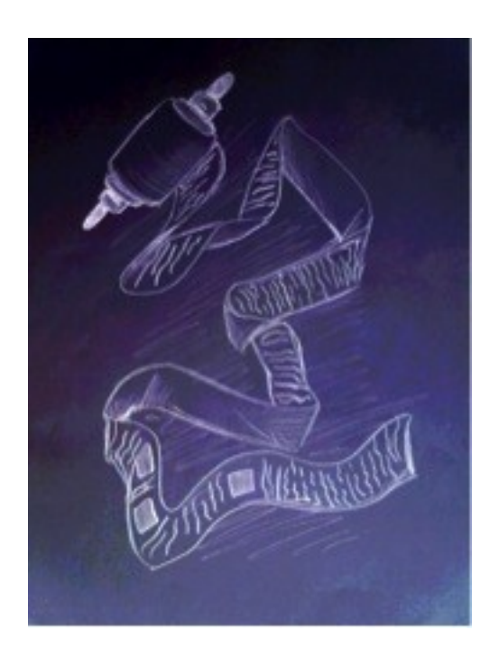
Illustration 5: "The unraveling script" (p.52) [17]

Creating art to make sense of an arts-informed methodology and theoretical lens was a novel approach to using art in health care research that supported my understanding and subsequently, rigorous employment of narrative inquiry and critical feminist theory. [18]