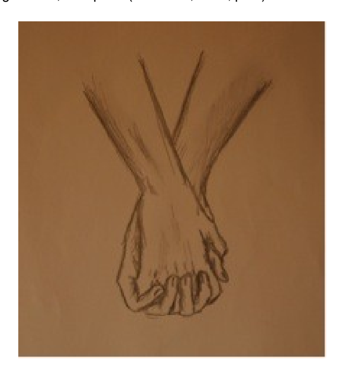
Illustration 3: "Interlocking hands" (p.42) [12]

While reviewing the literature on IBS and chronic illness and intimate relationships, I reflected on my thought processes while reflexively sketching: