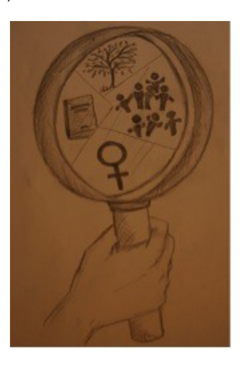
Illustration 4: "The magnifying glass" (NGUYEN, 2015, p.23)

As such, I drew upon the power of creating art to support the rigorous employment of the methodological approach (narrative inquiry) and theoretical lens (critical feminist theory) in my study. In doing so, I discovered that a complimentary fit transpired between the artistic process and the narrative inquiry underpinned by critical feminist theory. The abstract quality and extensiveness of research methodologies and theories can often be overwhelming to grasp. As such, I utilized the symbolism of art and its capacity to comprehensively amalgamate a plethora of feelings, ideas, and concepts into a single image (HUSS et al., 2015) to visually define narrative inquiry and critical feminist theory (see Illustration 4 and 5).