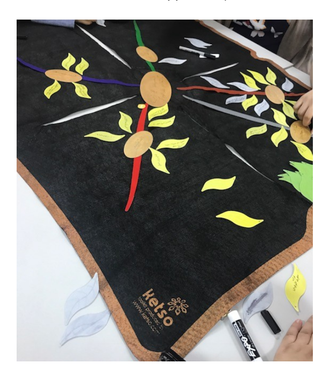
Figure 1: A Ketso session with a group of female Saudi teachers [14]

In a typical Ketso session, participants are asked to reflect on their experience, identify positive aspects of situations as well as challenges they face, and respond to challenges by thinking of solutions. This is enabled by the nature of the hands-on kit, with color-coded "leaves" on which participants write their ideas, and a felt surface on which they place their completed leaves alongside thematic branches (see Figure 1). The Ketso developers (TIPPETT & HOW, 2011) state that focus group facilitators may develop their own meaning for the differently colored leaves. However, they give several options for standard meanings for different contexts, which all roughly follow the pattern: brown leaves signify "what works" or "what we have already" (metaphorically corresponding to the soil in which the three structure grows); green signifies "future possibilities" or "solutions" (corresponding to new leaves in the tree); yellow signifies "goals" (loosely linked to the sun driving growth); grey signifies "challenges" (corresponding to clouds that get between us and the sun, but also bring rain—to grow more ideas; for additional uses see pp.15-20).