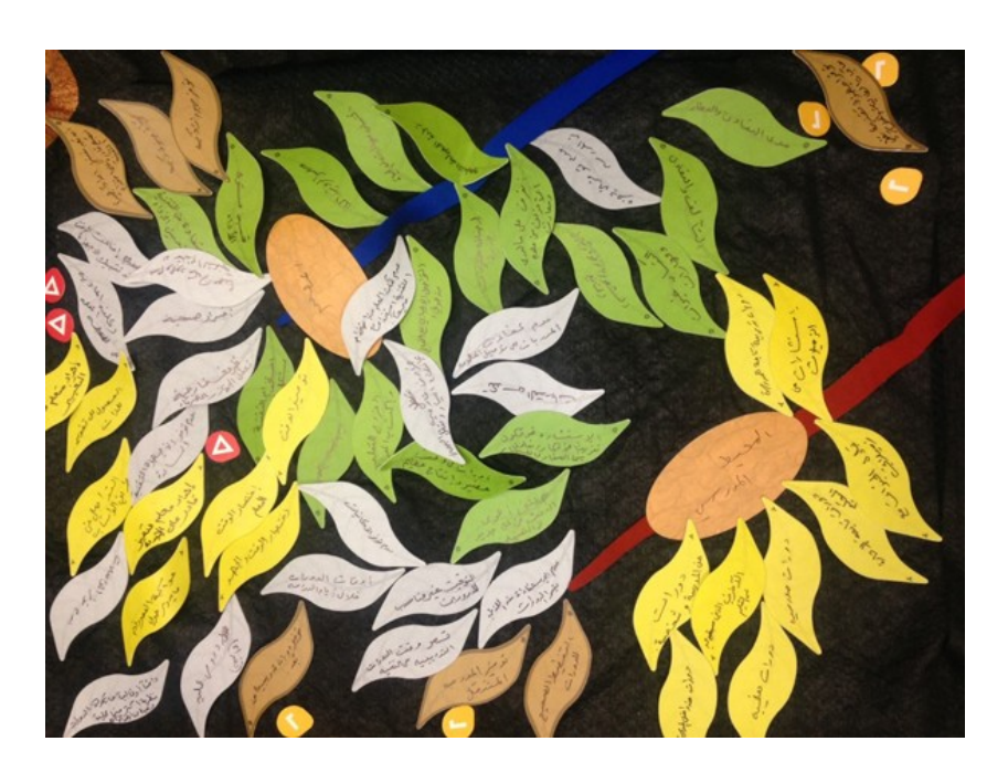
Figure 3: Part of the Ketso felt at the end of the session [36]

The discussion so far, and the fact that the Ketso felt may become very crowded with leaves (see Figure 3), indicates that a few ground rules may be needed if a qualitative researcher intends to explore similar views among participants in a Ketso session. For one, the number of themes and sub-themes may need to be limited, thereby reserving as much space as possible for the participants to neatly cluster similar views. It would also be useful to have participants mark their leaves with a unique identifier (e.g., their initials or a number or simple symbol, or to hand out pre-marked leaves to individuals) if the identification of unique individual views is important to the research aim (the retrospective analysis in Table 1 relied on recognizing the participants' handwriting). Finally, Figure 3 shows the use of a white-on-yellow tick mark that the participants used to highlight the most important or salient experiences they had (brown leaves), and a white-on-red triangle that they used to mark the most important/salient challenges (grey leaves). Just as with the differently colored leaves, the Ketso developers encourage individual project teams to develop their own locally appropriate uses for these additional markers. This provides additional affordances for qualitative researchers to generate data for understanding individual or shared views. [37]