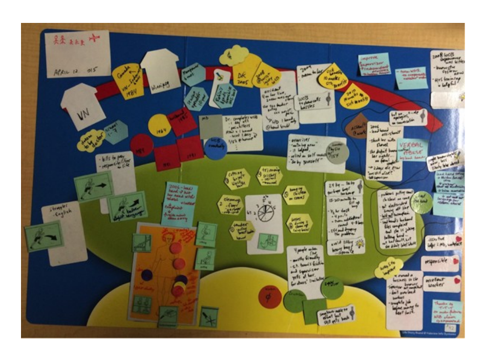
Figure 4: Life-scape example (Newcomer workers study) [3]

Introductory training to use the LSB is typically offered in one or two day small group workshops that include demonstration and experiential components. The content and process of the training may vary based on the objectives and interests of participants. The standard LSB kit includes a 40 page manual and several guide sheets that introduce LSB concepts and explain the Elements card sets, marker sets and other components. The purchase of the LSB ($300 US) is associated with a one- or two-day small group training workshop, and two to three hours of individual orientation, in-person or via web-video. [4]