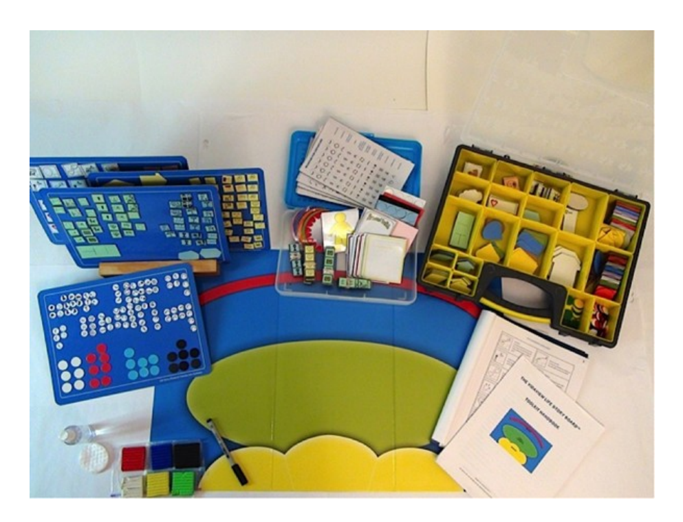
Figure 2: LSB kit