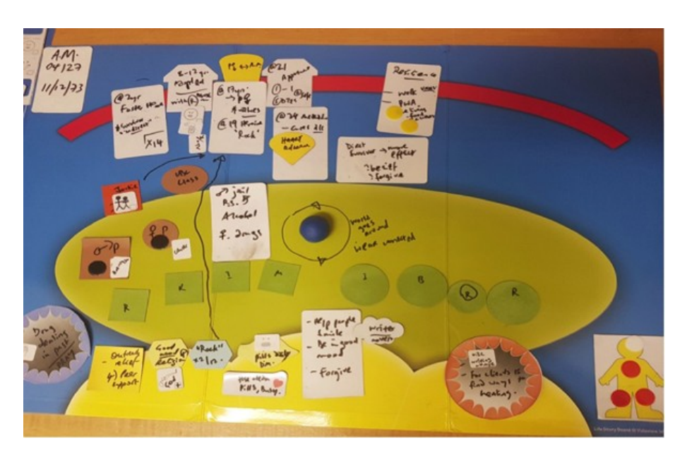
Figure 3: Life-scape example (Aboriginal males study)