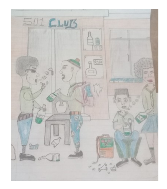
Figure 3: Representation of underage drinking practices

In addition to encouraging vivid expressions, we found that the expression itself (i.e., poems, drawings, lyrics etc.) also facilitated meaningful engagements during the FGDs. In this regard, the expressions worked as "a door opener providing concrete talking points, keeping participants attention, and allow[ing] them to take on the role of experts of their own lives" (WANG & HANNES, 2020, p.1). This is evident in the extracts provided in the previous sections of this paper, where the expressions promoted in-depth discussion of the broader context of underage drinking. The expressions allowed other participants in the group the "language" to share their own stories and perspectives, creating an intersubjective understanding of the issue. We also offer another example here to illustrate this collaborative reflection, where participants discussed the drawing that they shared in response to one of the prompts (see Figure 3).